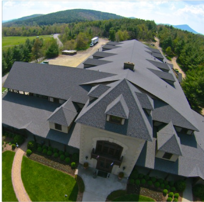
OUR VIRGINIA WINERY

301 Harley Road • Wilmington, NC • 910.799.3011 • coastal-bev.com